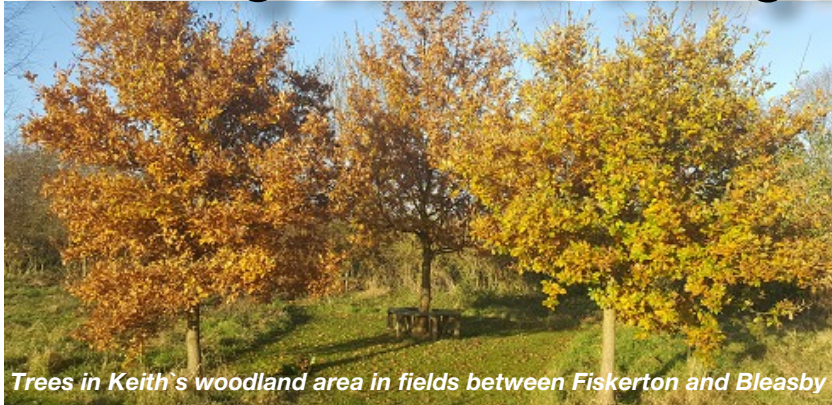
Trees in Keith's woodland area in fields between Fiskerton and Bleasby